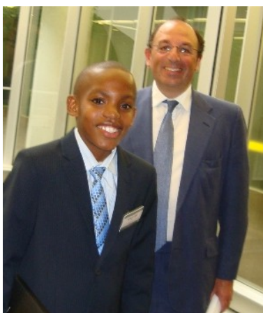
Leading by example

These are still comparatively early days of the project, there still remains much to be achieved in our quest to bestow on our community future Young Leaders.