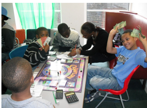
Show me the money! Summer financial Literacy session

Summer holidays offer great opportunities for developing Leadership and this year the Programme started with a day's orienteering in Bostall Woods near Woolwich. With the aid of map and compass, the boys worked in pairs to navigate their way around a series of way-markers. The course was tricky because there were many paths through the tangled woods and it was easy to take a wrong direction and get off course. The secret was to keep checking the compass and eventually, after many dead ends, the teams found their way back to the start. A great day in beautiful weather.