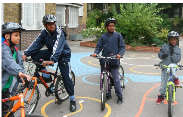
On your bike! - Young Leaders' learn safe cycling skills

We were very lucky that the sailing week in the Isle of Wight was fully funded by the UK Sailing Academy. We hope to take another group back there this summer and there will be opportunities in the future for some of our older boys to train as sailing instructors.